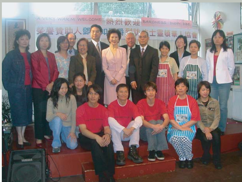
Islington Chinese Association, London, has been chosen as winners of this year's prestigious Queen's Award for Voluntary Service, giving recognition to the unsung heroes in our community that play an essential role in our daily lives. ISA's Management Committee, staff and guests pictured.