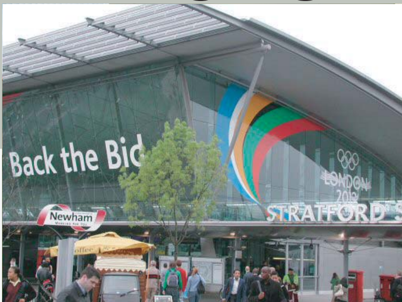
Back the London 2012 Olympic Bid.